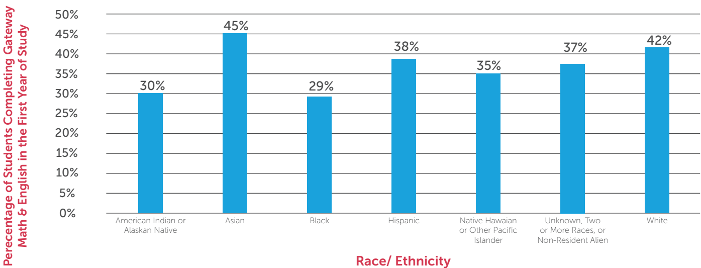
Figure 2. Gateway math & English completion in the first year of study rates by race/ethnicity: Fall 2018 cohort.