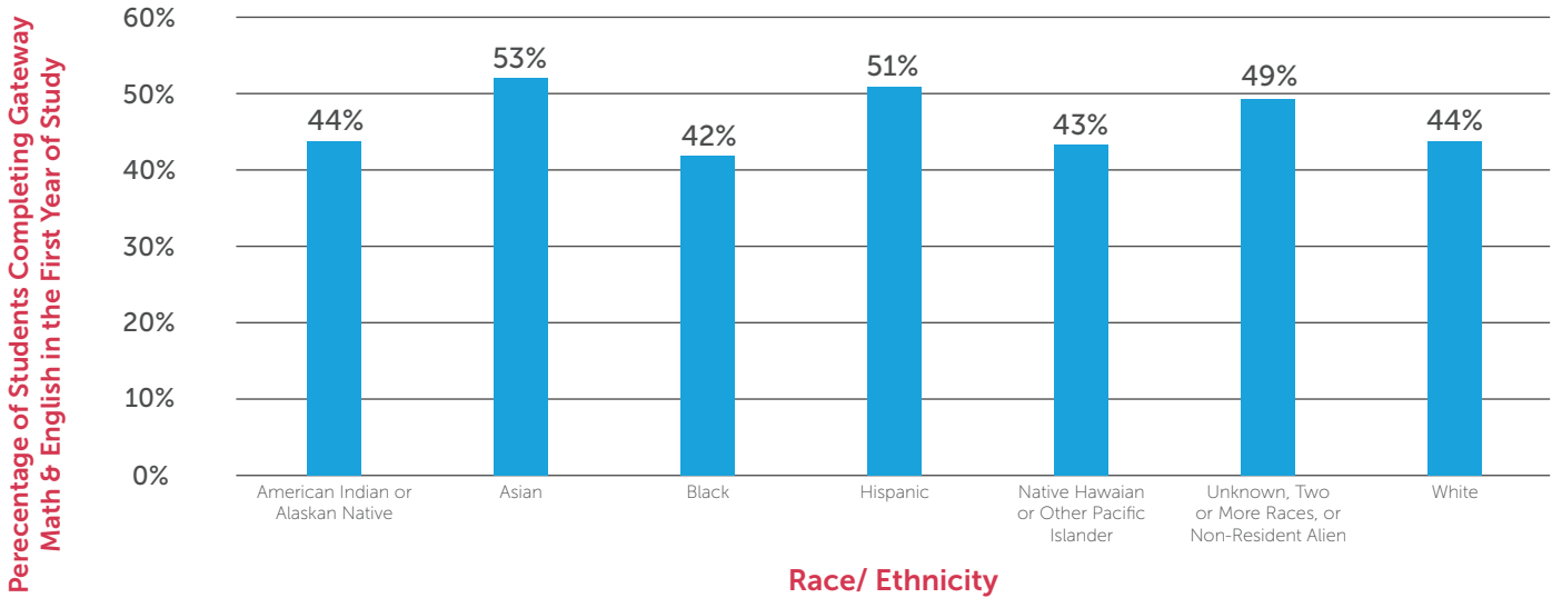
Figure 2. Gateway math & English completion in the first year of study rates by race/ethnicity: Fall 2018 cohort.

When examined by a student's race or ethnicity, completion rates varied for students who identified as American Indian or Alaskan Native (44%); Asian (53%); Black (42%); Hispanic (51%); Native Hawaiian or Other Pacific Islander (43%); Unknown, Two or more races or Non-resident Alien (49%); or White (44%).